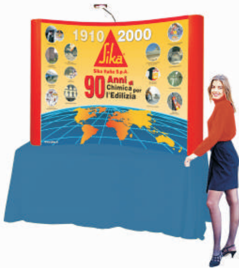
Picture shows graphic front panel Upgrade